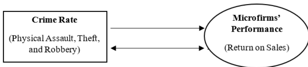
Figure 2. A conceptual framework to determine the effect of crime on firms' performance and the direction of causality among variables

Guided by this integrated concept and differing from the earlier works mentioned above, this study used constructs that were not considered before. Figure 2 depicts the conceptual framework of this study, which aims to examine how crime affects the performance of microfirms using profitability measures proxied by Return-On-Sales (ROS). To address the vagueness and inconclusiveness of evidence to establish how changes in crime rate affect microfirms' performance in previous studies, this paper used variables and methodologies that were not considered in the literature. As crime and business activities are both local phenomena (Matti & Ross, 2016), this work focused on a more in-depth and microlevel analysis to fully understand the effect of crime on firm performance. To confirm the dynamics between crime and business performance in the long-run and short-run periods, the study focused on microfirms that are more susceptible to this unfavorable phenomenon. It also examined the unbiased accounting-based performance measures of local microfirms and dove into an analysis of city-level crime rates.