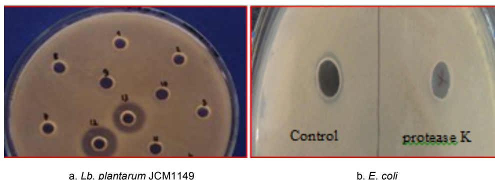
Figure 3. Recognize bacteriocin by proteinase K for NH3.6 isolate

Note: a. 12, 13, Control, the other well: proteinase K