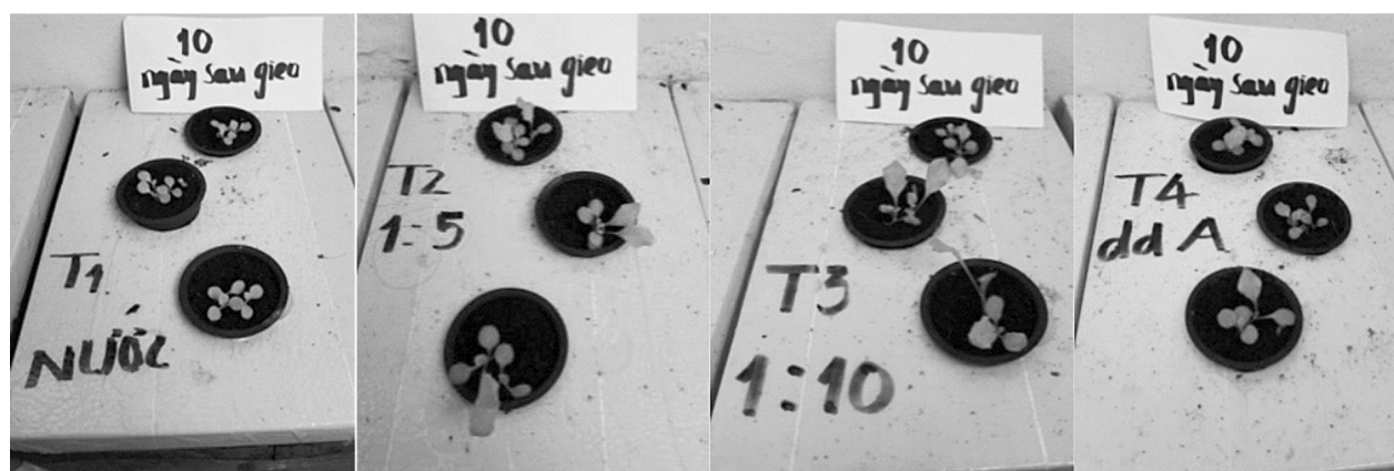
Figure 1. Ability of salad growth in initial period (after 10-day sowing)

However, from 10-day sowing to harvest stage, salad vegetable grown in SSC solution gave production criteria higher values than treatments of the control and commercial nutrient solution. When salad vegetable used nutrient solution from extracted SSC got thickest leaf and darkest color, compared to the control.