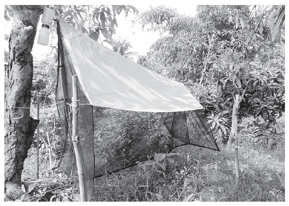
Figure 1. Malaise trap used to capture insects in Hoa An mango orchard

The Malaise trap was erected in orchards to a natural insect flight line. Flying pests were collected from the trap at 10-day period. The principle activity of traps is based on light orientation and behavior of insects to collect adult insects.