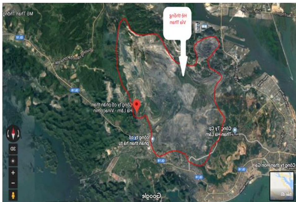
Figure 1. Ha Lam coal mine and location of the sampling

Ha Lam mine is located in an area with a convenient transport network. The 18A road through Ha Lam Coal Company connecting the provinces of Hai Phong, Hai Duong, Hanoi is an important route. There is also an 18B road, transporting coal from the field to the Nam Cau Trang coal refinery and the port of Cua Luc [1], (see figure 1). The location of the coal mine is near the sea, with roads suitable for operation and transport in large quantities.