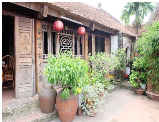
Figure 4. A typical old house in Duong Lam ancient village

Figure 3 and Figure 4 depicts the fact of house structure in Duong Lam Ancient village nowadays. These ancient houses were built three centuries ago, yet it still typifies an archetype of Vietnamese housing space in Vietnamese history. A traditional house of the Vietnamese includes a large yard where family members benefit from relaxing, playing and drying agricultural products after harvest. Nowadays, villagers take advantage of this space to put big jars in order to contain either water or sauce produced by glutinous rice. The sun makes jars of sauce become hot, and it becomes delicious. An ancient house of Duong Lam village is a combination between wood and laterite. The majority of housing designs is Ba gian hai chái (three compartments and two lean-tos). The main compartment is a worshipping place which is deemed to be an influential place of the family, and they