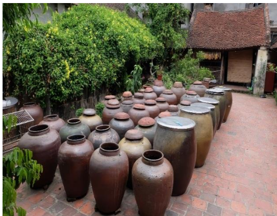
Figure 3. A yard of an ancient house in Duong Lam village

Most prominently, a system of well-preserved ancient houses of Duong Lam is highly attractive to both domestic and foreign visitors. It is estimated that there are more than 900 ancient houses in Duong Lam village, and most of them were erected approximately 300 to 400 years ago. Thereby, there is no denying that Duong Lam ancient village represents relics of ancient Vietnamese villages, which are experiencing a decline due to the modernization and industrialization in Vietnam.