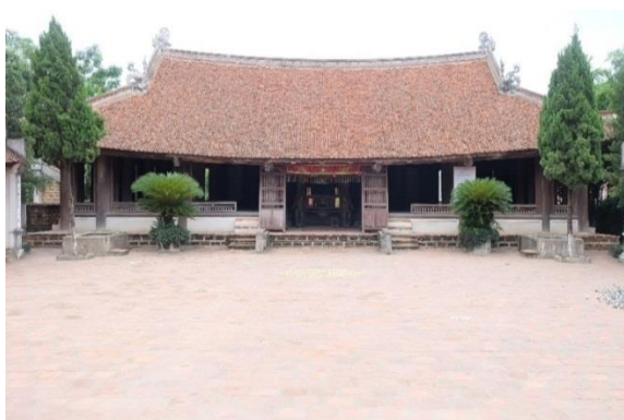
Figure 2. Duong Lam communal yard