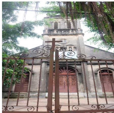
Figure 3. Duong Lam Catholic Church (Source: Author, July 21, 2020)

Besides, Duong Lam has a Catholic Church in the center of the village.