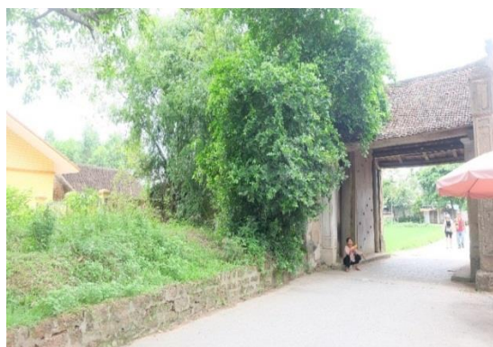
Figure 1. Duong Lam village gate