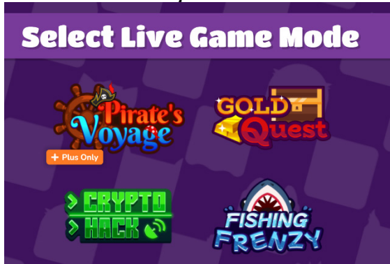
Figure 2.4 Game selection interface