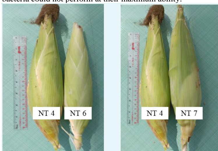
Fig 1. Comparison of corn products between treatments

In treatment NT5, the 4 bacterial strains have to compete for nutrients and living environment. Therefore, these bacteria could not perform at their maximum ability.