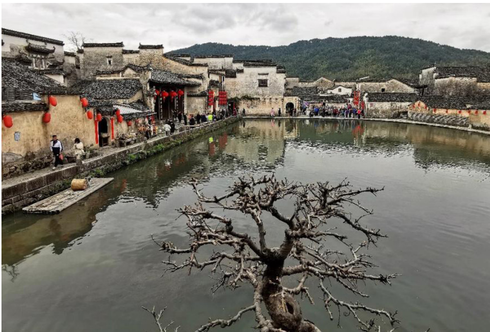
▲ The Huangshan Municipality in the PRC implements measures to mitigate the risks of climate change

More consideration needs to be given to water conservation for Huangshan to become resilient to increased drought hazards and prevent long-term water scarcity. Extreme weather phenomena, such as flooding, drought, or high temperatures, can also reduce labor productivity and damage production chains, slowing local economic growth. Other impacts include a reduction in both agricultural yields