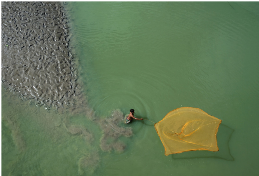
▲ The Mangrove Photography Awards

Bringing lost ecosystems back to life is a daunting task. However, one of the most effective ways to protect and restore damaged mangroves is through enhanced recognition and implementation of Indig-