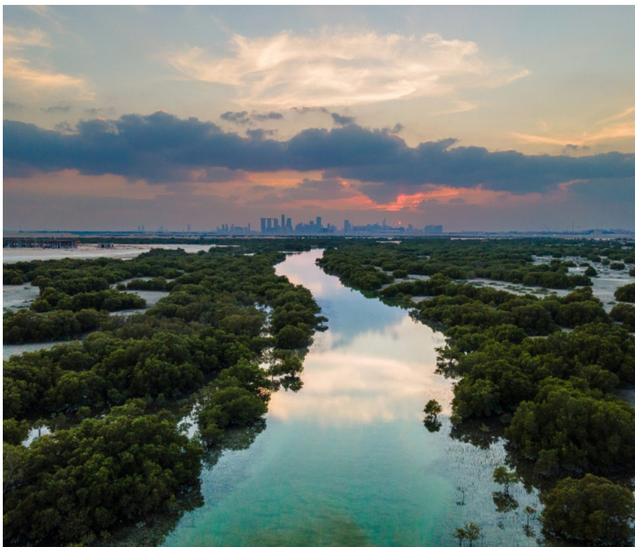
▲ A corner of Dam Bay Mangrove Forest in Vinh Nguyen Ward, Nha Trang City in Khanh Hoa Province

Not only do mangroves help prevent the progression of climate change, they also play an important role in limiting its impact. As global temperatures rise, extreme weather events like storms and flood surges are becoming more frequent and severe. The trunks of mangroves absorb the impact of waves, making them an excellent front line of defense that helps to protect higher ground. Restoring and protecting mangroves and valuing their role as a nature based-solution improves resilience of coastal communities and national economies.